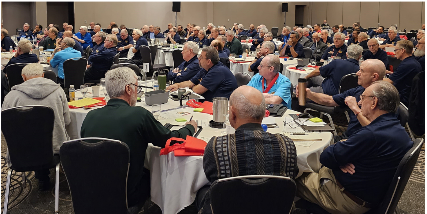
123 members of the Ontario Knights of Columbus leadership attending the business sessions.

First and foremost, I am thrilled to share that we exceeded all expectations during this workshop. With a remarkable turnout of 86 District Deputies in attendance, it was a testament to the commitment and unity of our Order. What's more, the opening ceremony on Friday night saw a participation of 228 members, and an astounding 276 members joined us for the DD Christmas Banquet dinner on Saturday night, making it a truly special and memorable occasion.