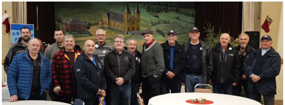
Photo: Council 16003 in Wilno

Congratulations to Council 16003 in Wilno which has the distinction of having the highest ratio of members to its community: one member for every 6 members in the community.